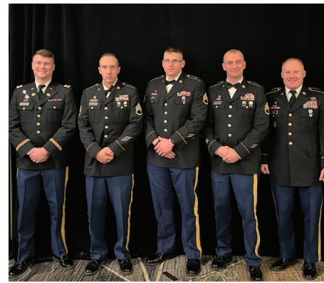
On Saturday's "Of the Year" Banquet, the Presentation of the Colors was performed by the 945th Engineer Company - Ohio Army National Guard.

ful DEC, general sessions, meetings, and trainings. These supporting Legion Family organizations gathered for the tools and knowledge they need to keep thriving.