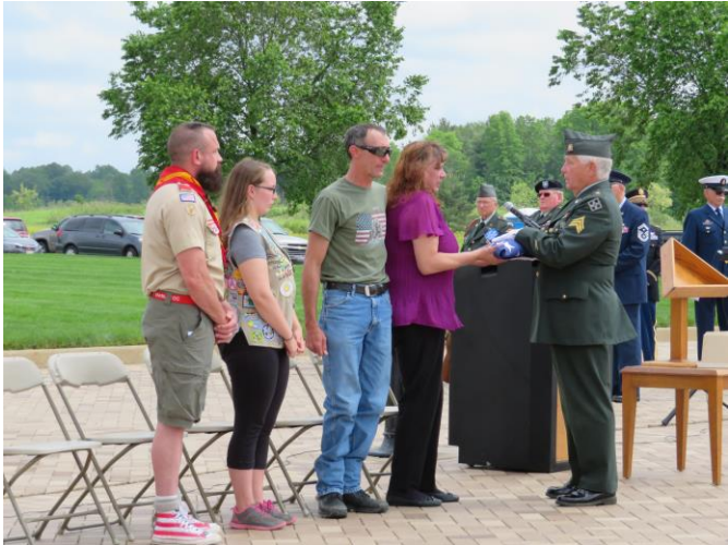
The couple who found and cared about a veteran, receive his American flag during the military service.