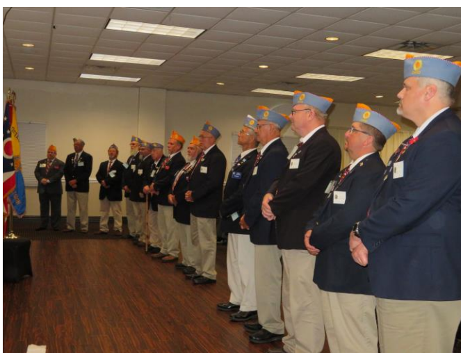
Installation of the 2017-2018 SAL Detachment Officers.