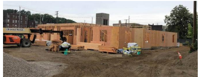
Cleveland Fisher House

Fisher House. Veterans from across Ohio and the country come to the Cleveland VA Medical Center for national and regional medical programs and services. Many Veterans cannot bring their spouse, children or parents because of the financial burden extended lodging can place on a family. By winter 2018, these Veterans and their families will be able to stay at the Greater Cleveland Fisher Homes while receiving care. These two, 16-bed homes, would not be a reality without the support of the community who worked together to raise $3 million dollars in support of Veterans receiving care here.